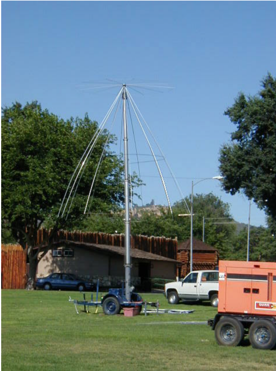
Dave WA6TYJ's wind generator. We all know how hot it gets at Field Day!